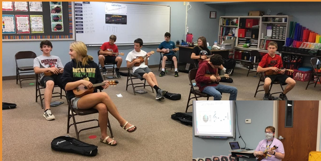
The 8th Graders have begun their Ukelele Unit! Thanks to Keystone, we are able to get the instruments for this unit - it's a favorite!

We pray this in the name of Jesus - AMEN.